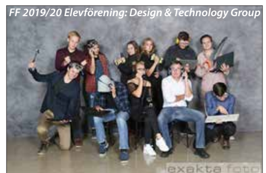
FF 2019/20 Elevförening: Design & Technology Group