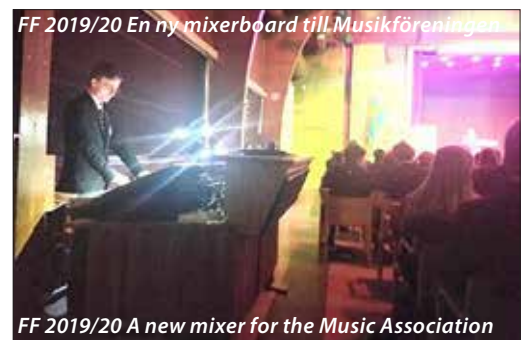
FF 2019/20 En ny mixerboard till Musikföreningen