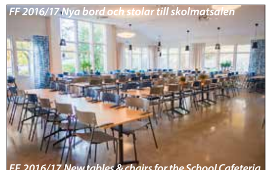
FF 2016/17 Nya bord och stolar till skolmatsalen