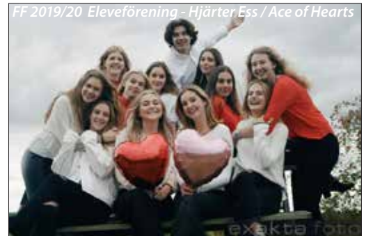
FF 2019/20 Elevförening - Hjärter Ess / Ace of Hearts