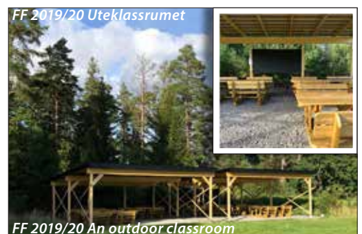
FF 2019/20 Uteklassrummet