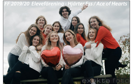
FF 2019/20 Elevförening - Hjärter Ess / Ace of Hearts