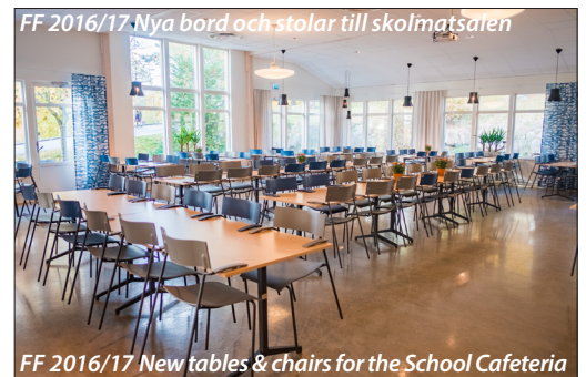
FF 2016/17 Nya bord och stolar till skolmatsalen