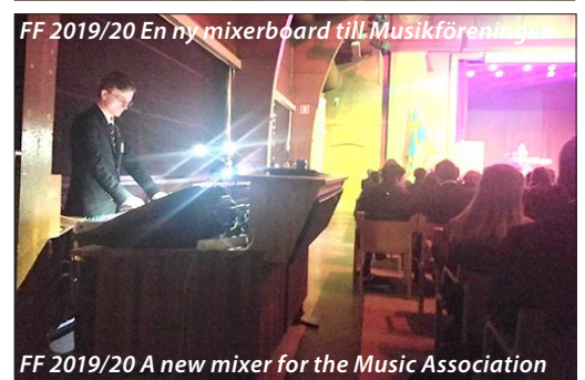
FF 2019/20 En ny mixerboard till Musikföreningen