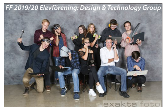
FF 2019/20 Elevförening: Design & Technology Group