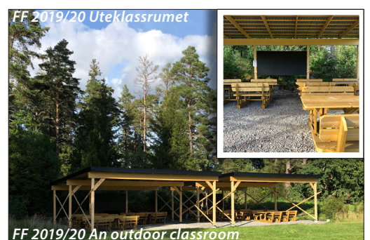
FF 2019/20 Uteklassrummet